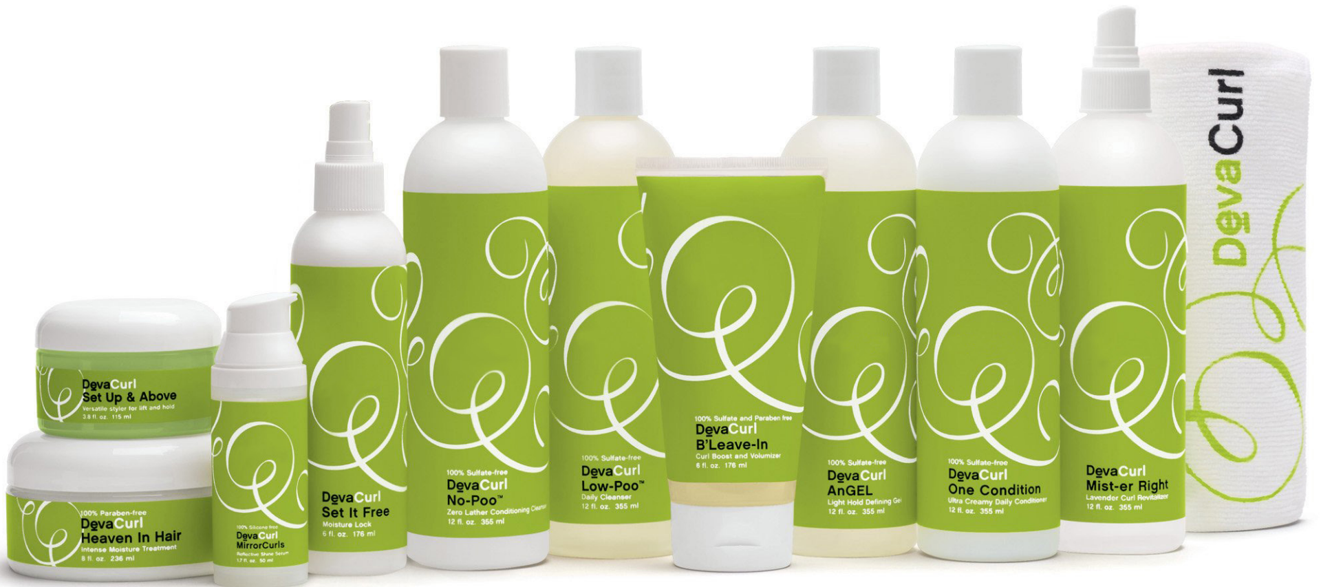
DevaCurl | Original Product Line and Packaging