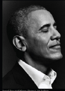
Portrait of Barack Obama