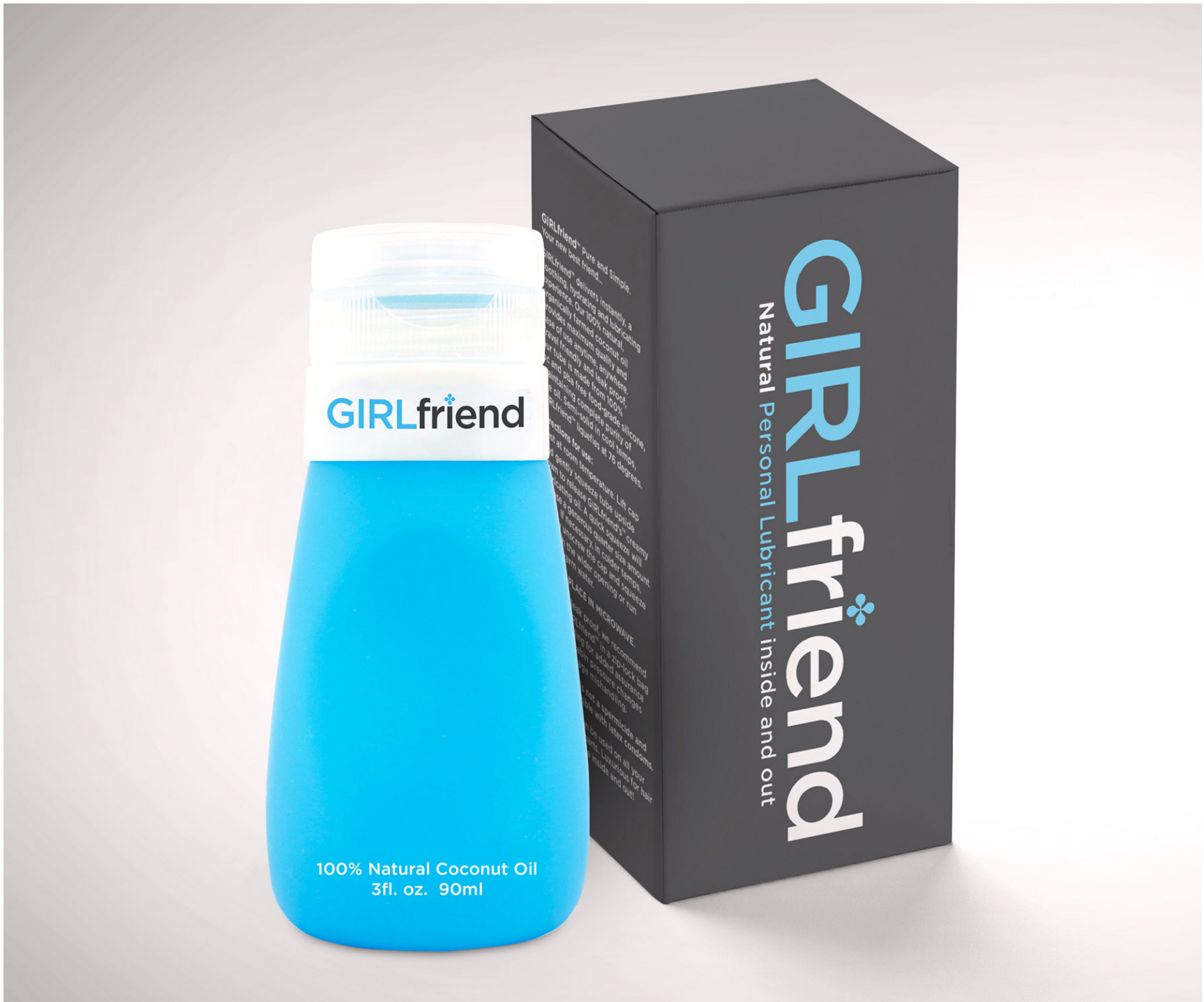
Girlfriend Cosmetics | Logo and Packaging