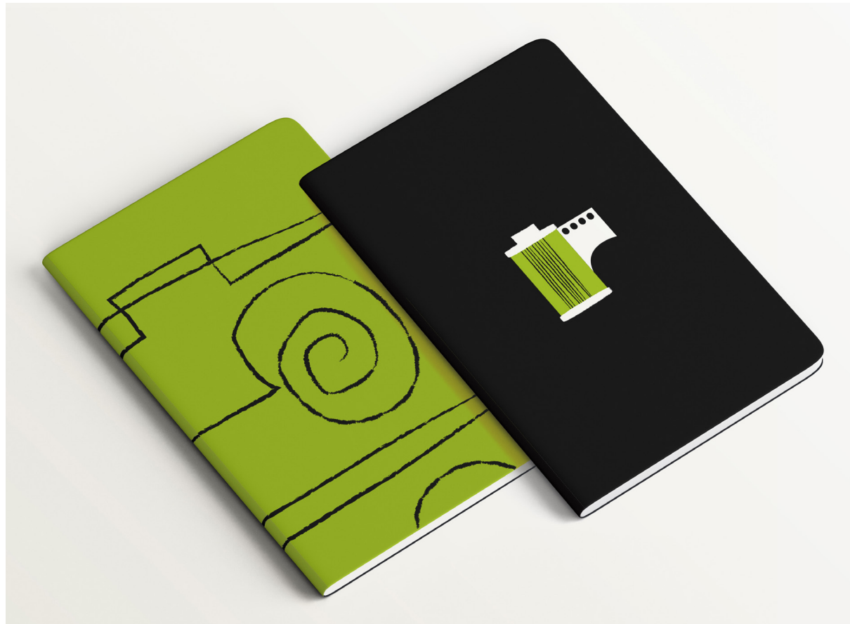
APA National | Webinar Site Logos | Event Notebooks